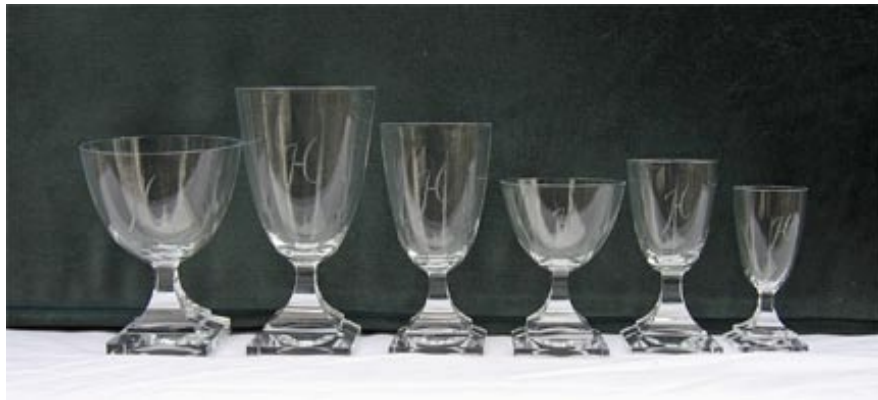
Crystals Glasses 1 - 6 left to right

I began with a set of six crystal glasses. Within each set of crystal glasses there were 10 glasses to choose from giving me 60 glasses to sample. I've numbered the six crystal glasses 1-6. Each of the 10 glasses in each set were exactly the same size and you would think they would create the same pitch, however they do not. The pitch variation in within each set different by as much as a fifth. This gave me a great amount of sonic variety to choose from. When I combined to the six glasses I had about 1 1/2 octaves of different pitches to choose from. Among the six sets of crystal glasses there were many overlapping pitch ranges. Again, this gave me many options in the way that these samples were mapped across the keyboard in various combinations with each other.